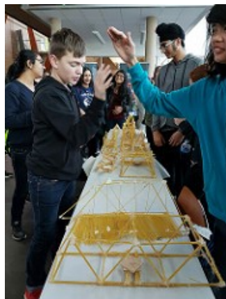
Spaghetti Bridge Building

Many regional competitions continue to offer hands-on activities and stations such as "Try A Trade" where students can get involved and learn about potential trades and technology careers.